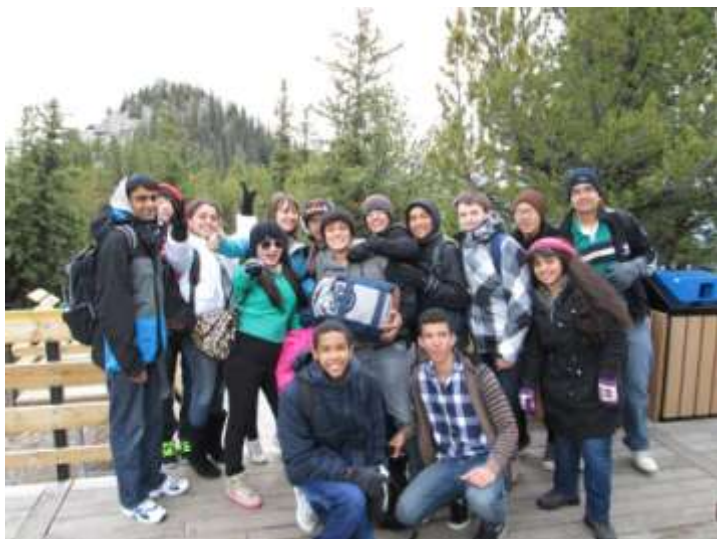
Hunting Hills class visit to Banff