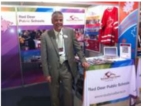
Red Deer Public Schools Superintendent at Agent Fair in Sao Paulo, Brazil